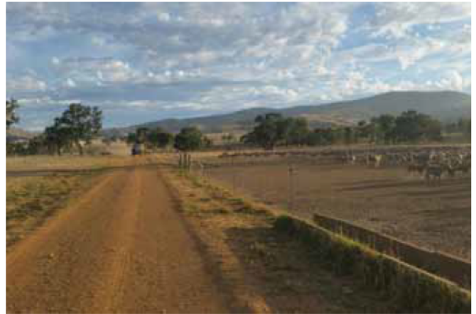
Containment yards and adjacent lane way.

The areas are also ideal holding paddocks for times including shearing, drenching, crutching and for quarantining brought-in stock.