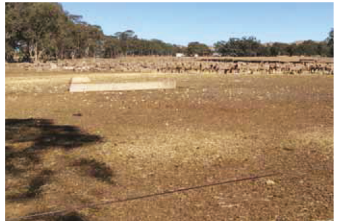
Sheep in containment .