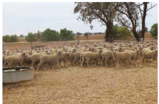
Sheep in containment.

All sheep are drenched and vaccinated before going into containment and Jim estimates it takes 7-10 days for the stock to get accustomed to the new environment.