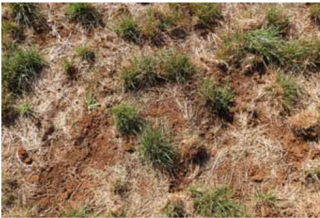
Figure 6.2: About 70% groundcover. Bare patches are quite large and start to join up, creating opportunities for soil movement.