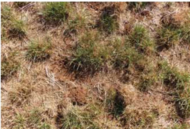
Figure 6.3: About 85% groundcover.

During a drought, or long dry summers, there is a high risk of losing valuable soil as pasture cover reduces. If pasture cover falls below about 70 per cent, wind will start to blow away soil particles, causing erosion and loss of valuable nutrients and topsoil. Bare areas will also be more prone to washing when the rain does come. Figures 6.1 to 6.3 provide a guide as to what a range of ground covers might look like in a perennial pasture. Even when stock have been removed, ground cover will continue to decrease as plants decay. This will accelerate with rain and wind, particularly in pastures dominated by annual species, so remove stock before critical ground cover targets have been reached.