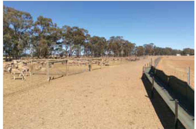
The feeding laneway and grain trough.

The fifth SCA is adjacent to the shearing shed and yards with separate laneway access to the other four SCAs.