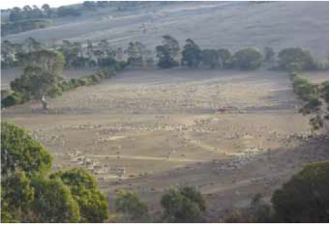
Figure 6.4: Sheep in a sacrifice paddock/containment area in south-west Victoria, June 2005, stocked at 12 m 2 /head.