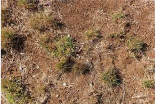
Figure 6.1: About 50% groundcover. A paddock that has been grazed this low is prone to considerable topsoil losses through wind and water erosion.