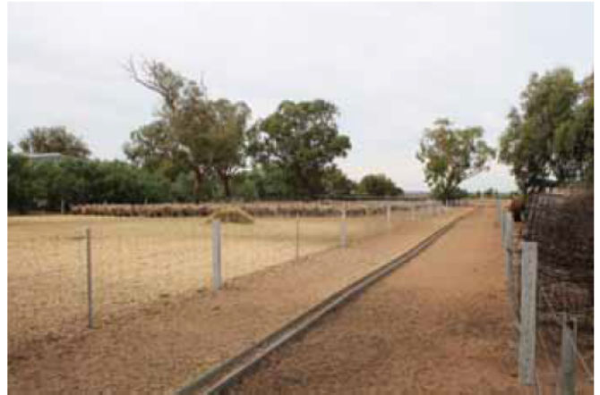
Steel purlin in adjacent laneway used for feeding grain.

He said crossbreeds had a very healthy appetite and a small space with lots of food was sheer paradise for them. But for Merinos it is a different story.